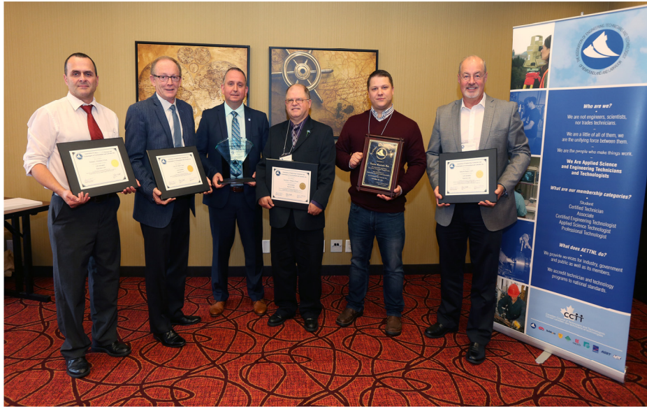
Above Photo - L-R: